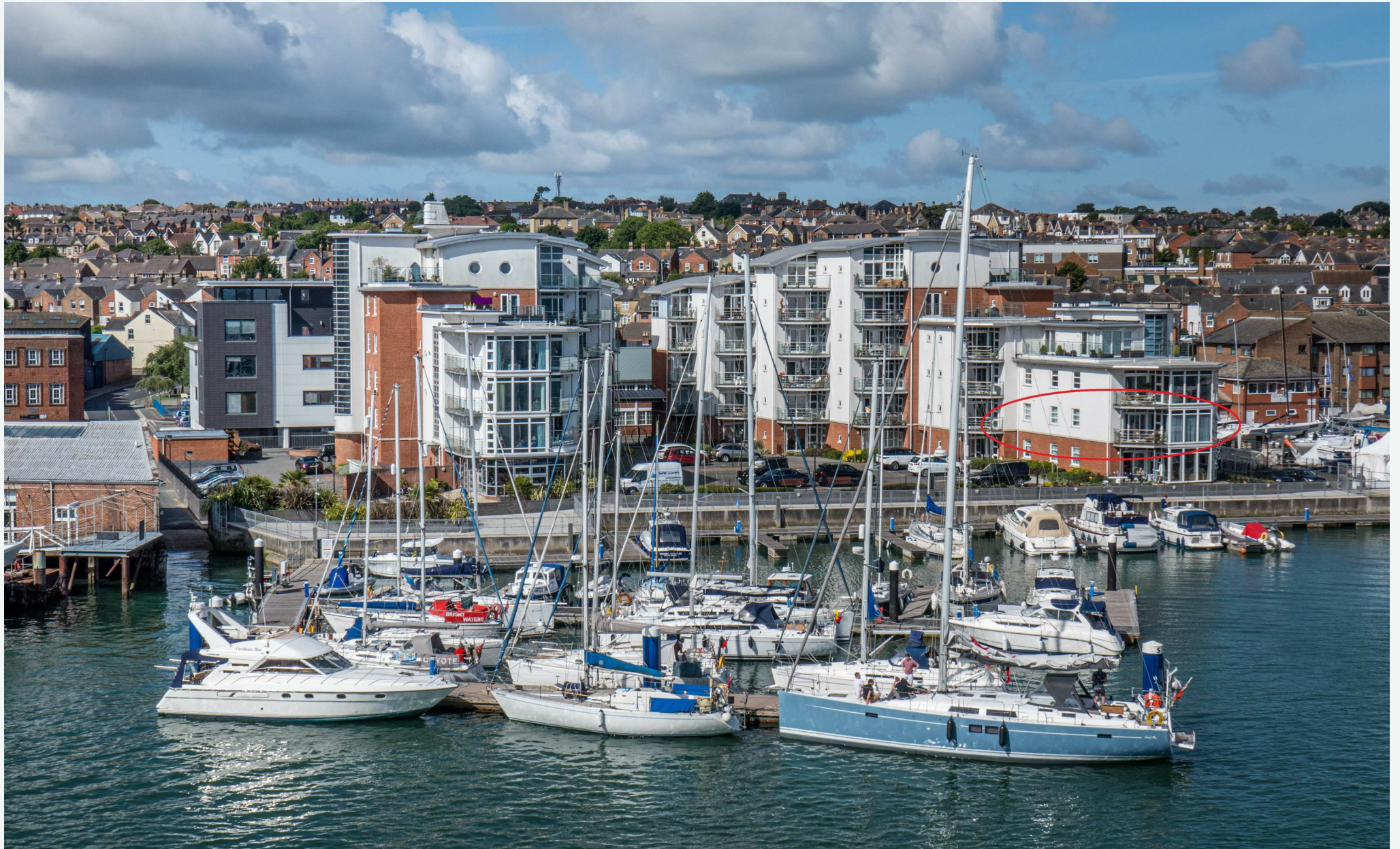
Apartment 23 Marinus, Medina Road, Cowes, Isle of Wight