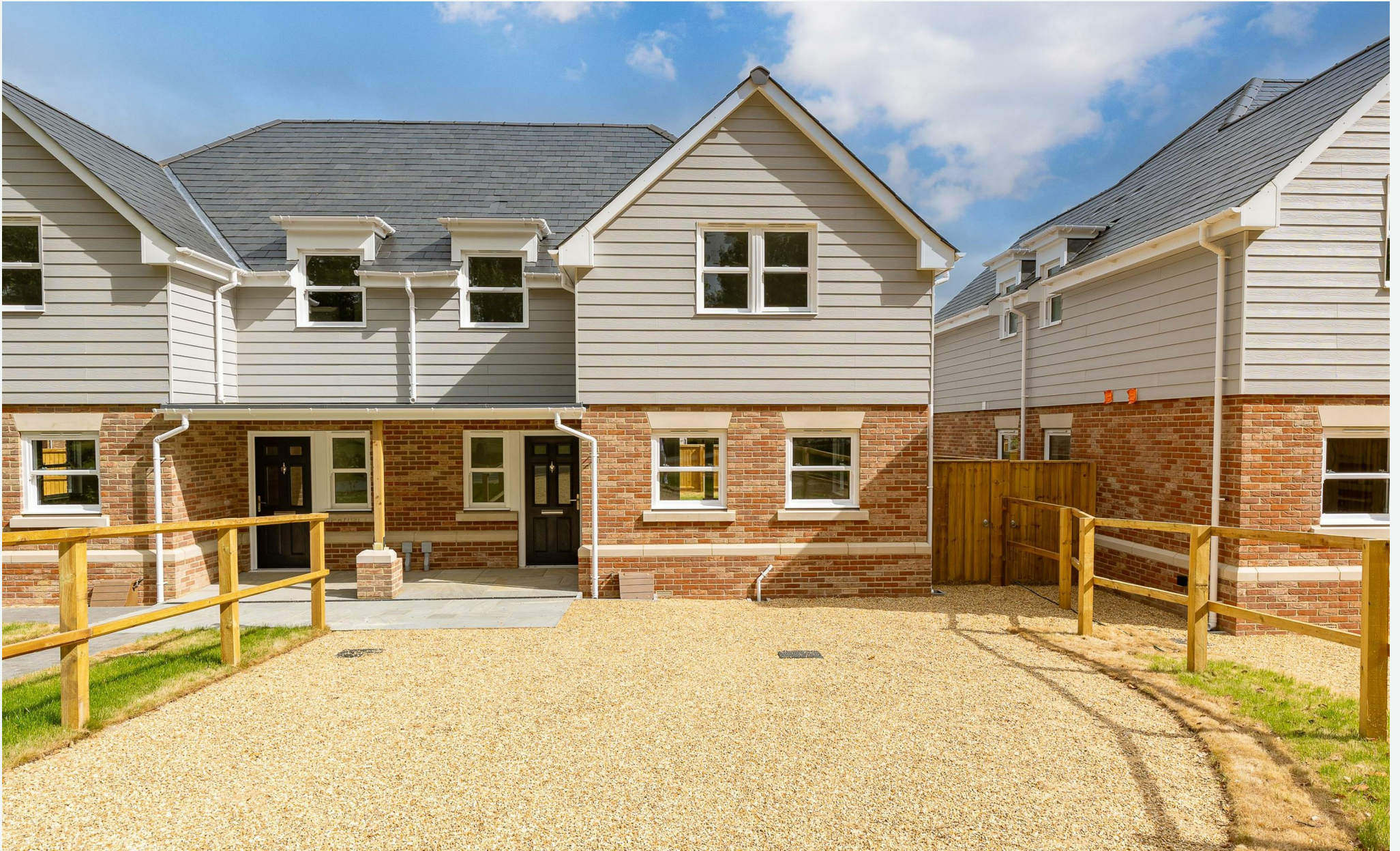
2 Spencer Park, Ryde House Drive, Ryde, Isle of Wight