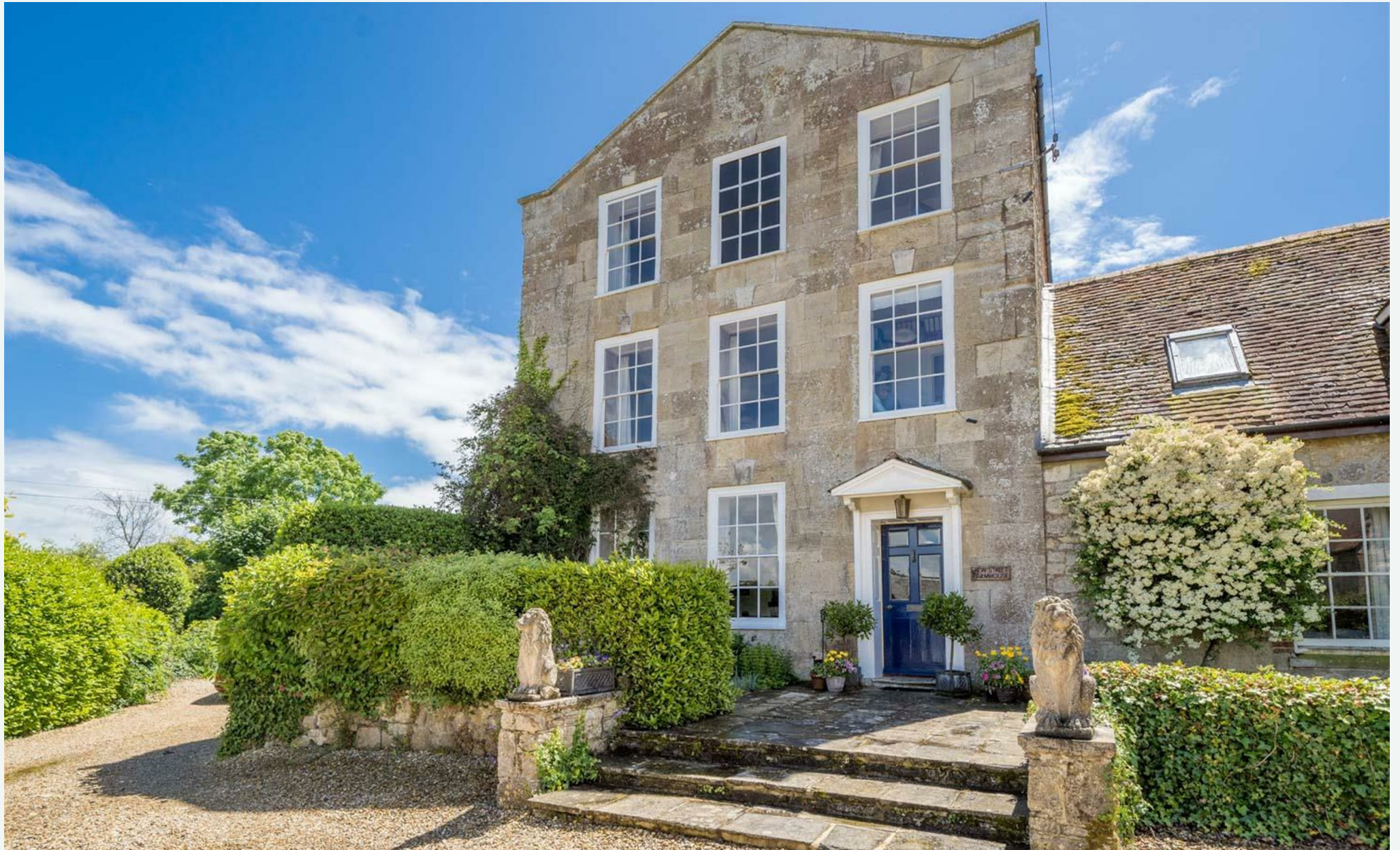
Rew Street Farmhouse, Rew Street, Gurnard, Isle Of Wight, PO31 8NS