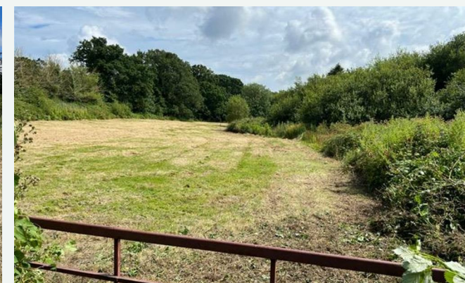
Land to the South of Sandy Lane, Nr Gatcombe, Isle of Wight