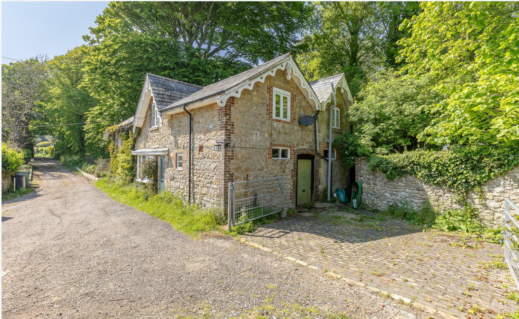
Coachmans Cottage, Castlehaven Lane, Niton Undercliff, Isle of Wight