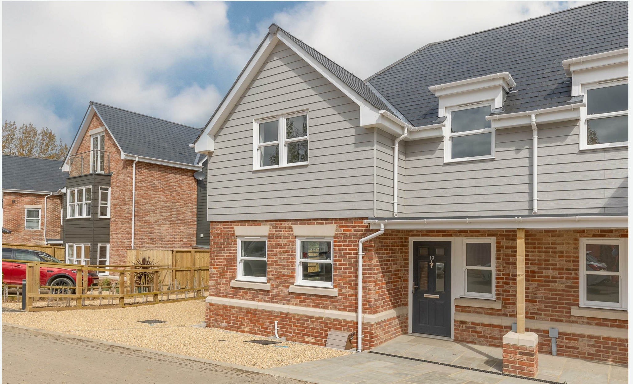
13 Spencer Park, Ryde House Drive Ryde, Isle of Wight