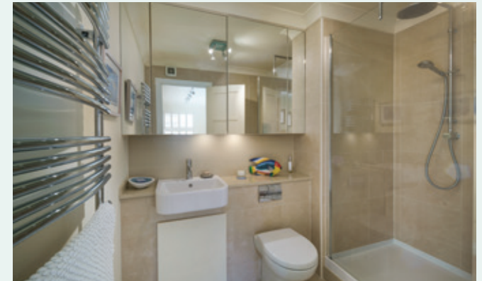
Apartment 15, Grantham Court, 10 Queens Road, Cowes