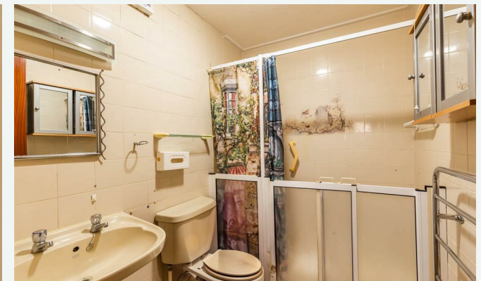
Flat 13, Brunswick Court, Medina Road Cowes, Isle of Wight