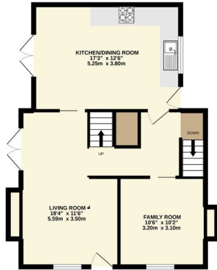
GROUND FLOOR 626 sq.ft. (58.1 sq.m.) approx.