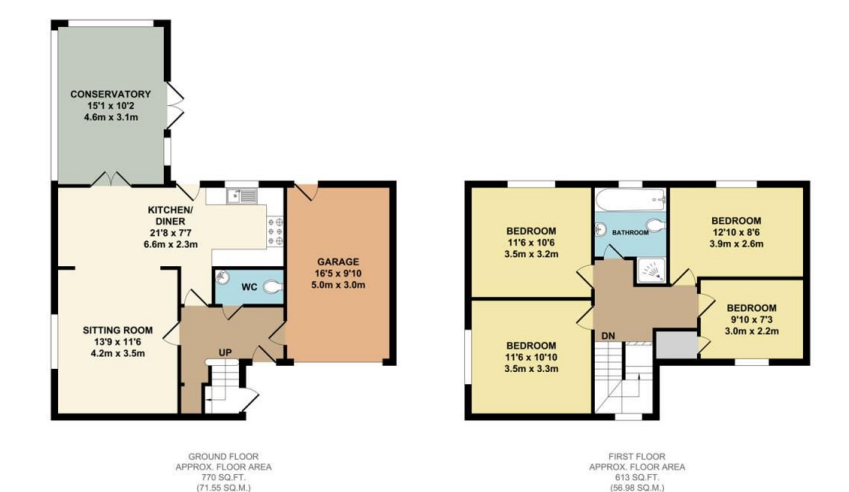
TOTAL APPROX. FLOOR AREA 1383 SQ.FT. (128.53 SQ.M.) Whilst every attempt has been made to ensure the accuracy of the floor plan contained here, measurements

vrimes very attempt rules user makes to ensure we accuracy or the word pair occination rule, releasurements of doors, windows, nooms and any other fatens are approximate and no responsibility is taken for any error, omission or mis-statement. This plan is for illustrative purposes only and should be used as such by any prospective purchaser. The services, systems and applications shown have not been tested and no guarantee as to their openability or efficiency can be given. Zome Media 20219