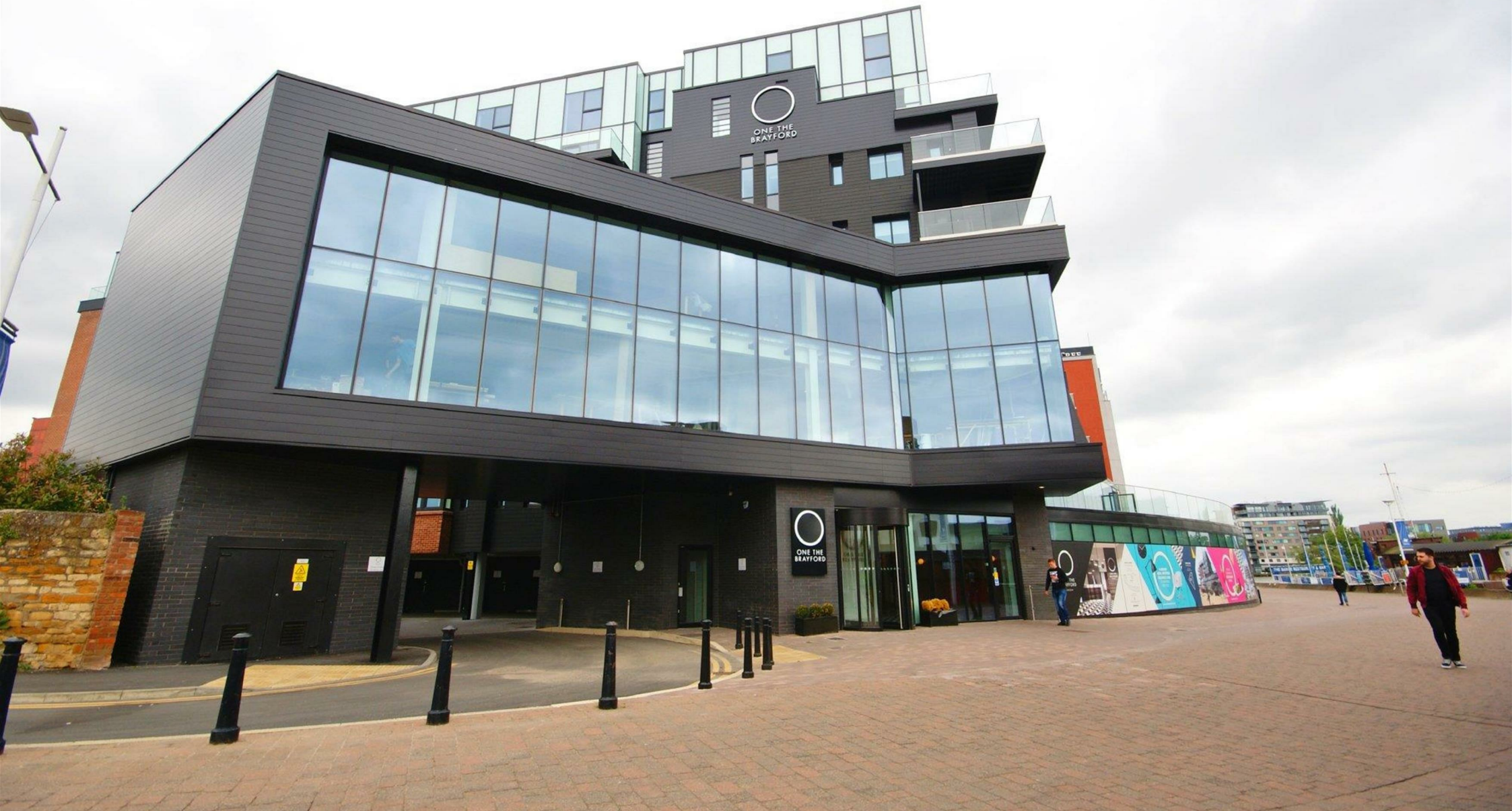
One The Brayford, Brayford Wharf North, LN1