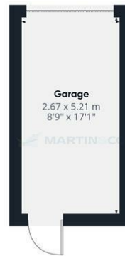
Floor 0 Building 2

Approximate total area (1) 107.48 m 2 1156.91 ft 2