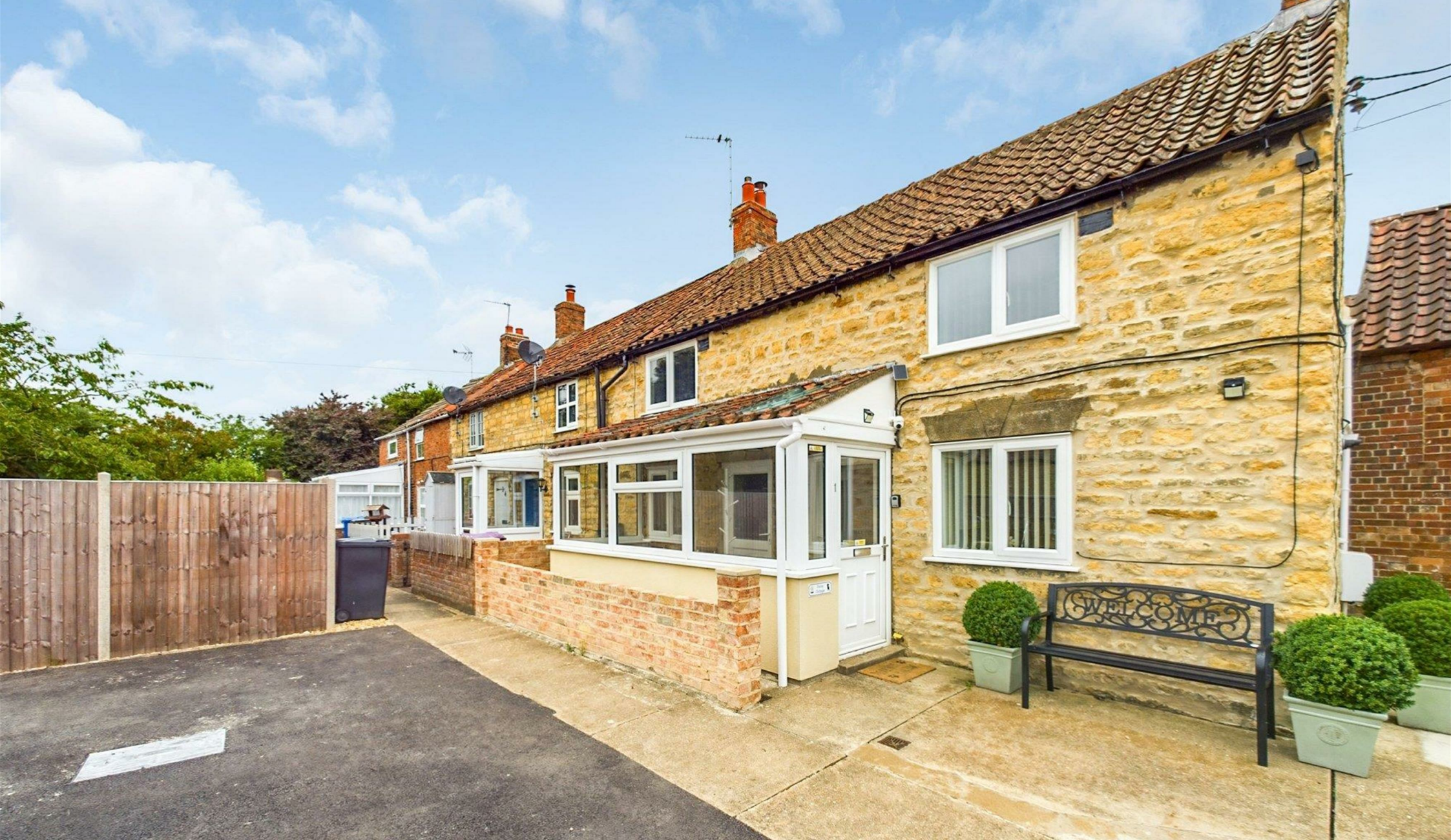
Daisy Cottage, Anyans Row, Ingham, Lincoln