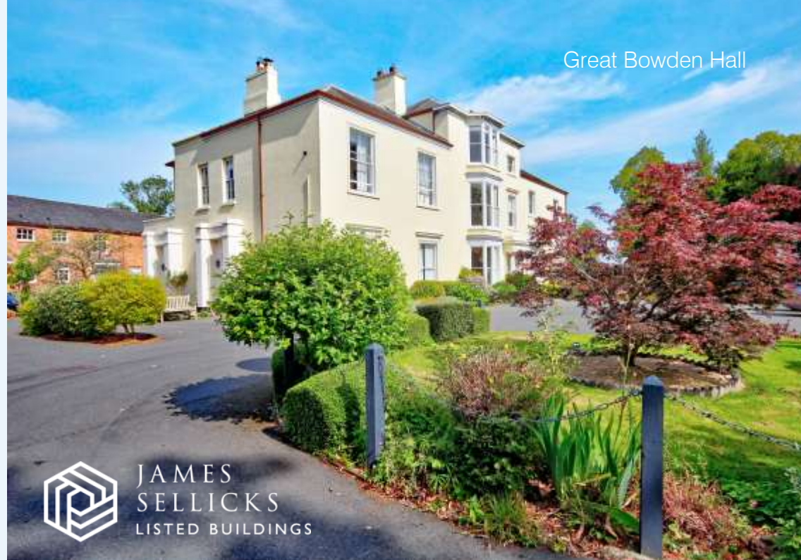
Great Bowden Hall

Great Bowden is one of the most highly sought after villages within the county both by virtue of the quality housing stock and strong community spirit, good local amenities include a parish church, post office, village store and primary school. There is a selection of places to eat and dine with two gastro public houses, the Shoulder of Mutton and Red Lion both recently renovated and upgraded and very popular amongst villagers and people who visit. In addition, there are two cafes, the renowned Bowden Stores which also has a gift shop and Weltons Deli which has a post office and shop, as well as a café.