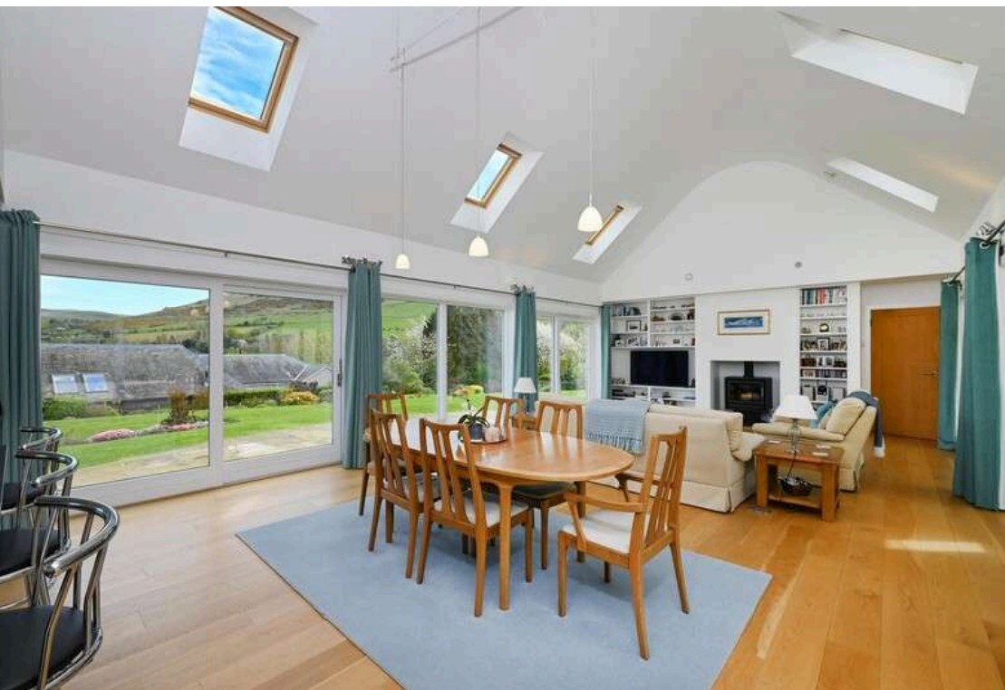
Property image 10 - back page