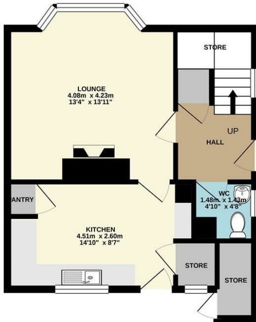
GROUND FLOOR 38.1 sq.m. (410 sq.ft.) approx.