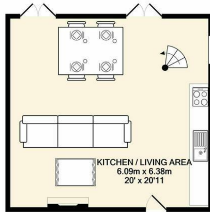
GROUND FLOOR APPROX. FLOOR AREA 38.9 SQ.M. (419 SQ.FT.)