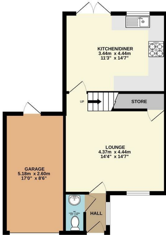
GROUND FLOOR 51.4 sq.m. (553 sq.ft.) approx.