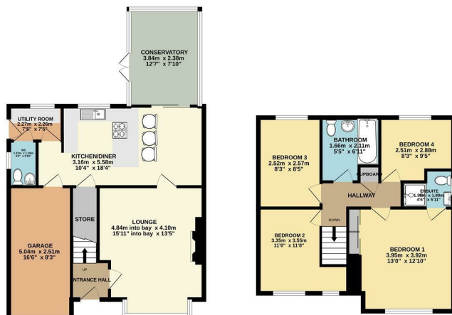
1ST FLOOR 53.7 sq.m. (578 sq.ft.) approx.

TOTAL FLOOR AREA: 123.7 sq.m. (1332 sq.ft.) approx.