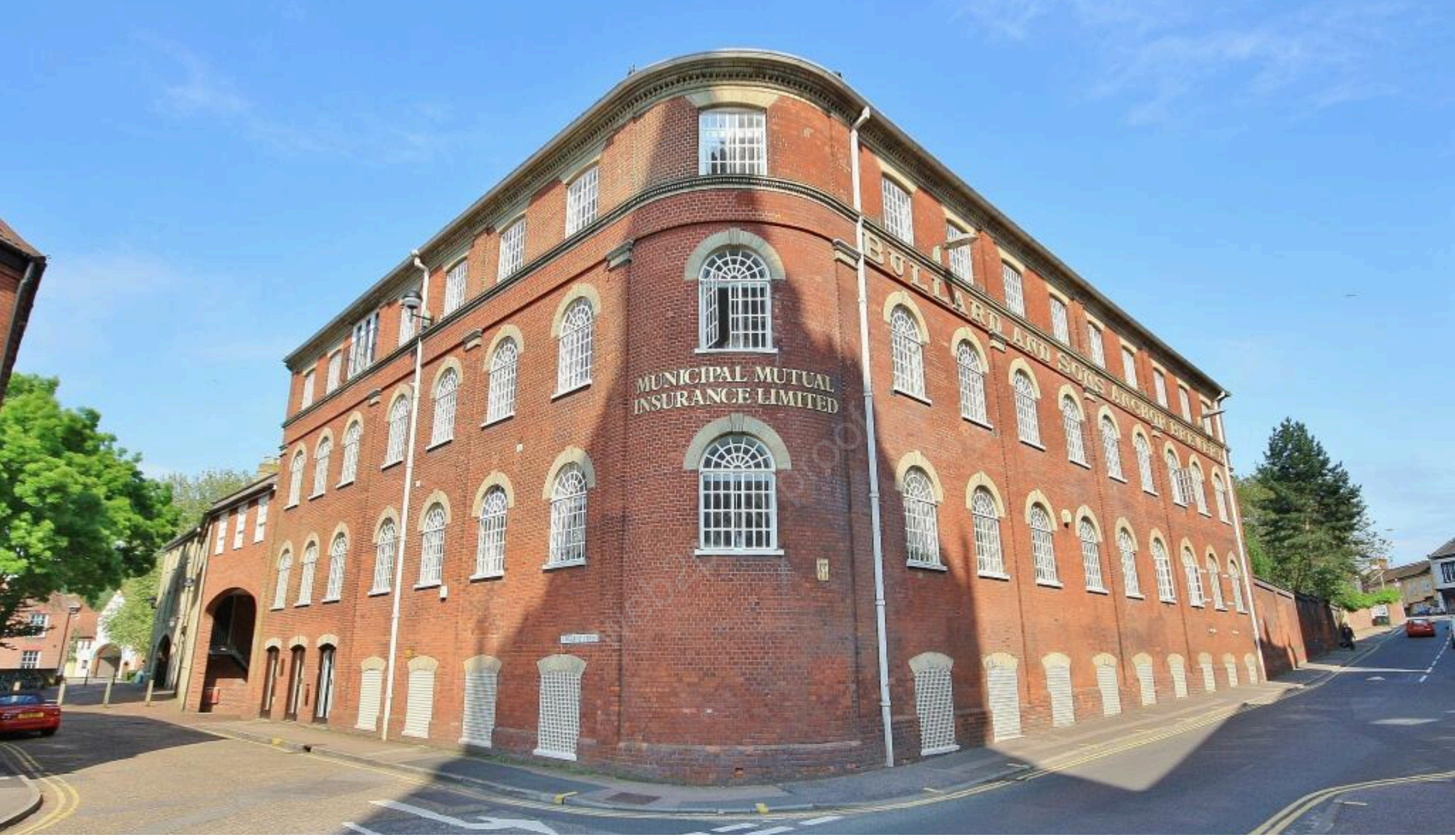
17 Anchor House Anchor Quay, Norwich, NR3 3XP