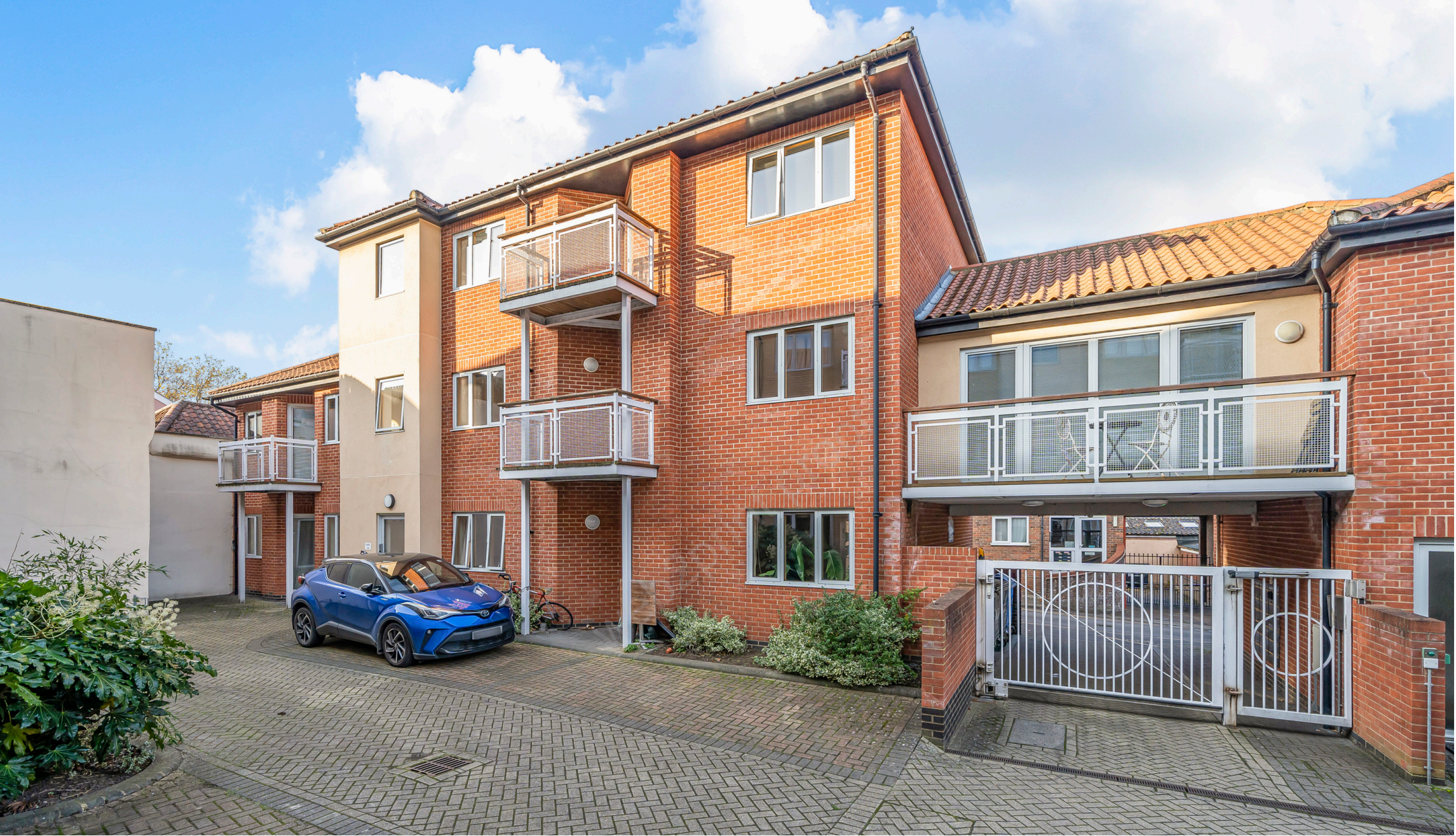
Apartment 4, Samson & Hercules Court Waggon & Horses Lane, Norwich, NR3 1HP