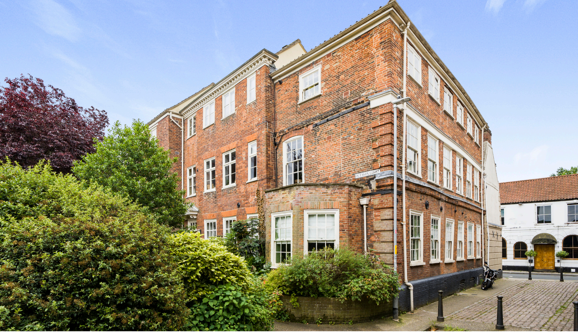
2 Octagon Court Calvert Street, Norwich, NR3 1AN