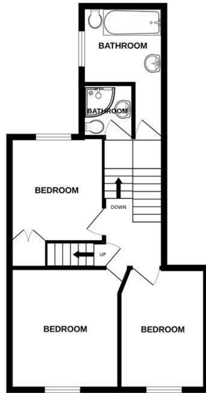
1ST FLOOR 478 sq.ft. (44.4 sq.m.) approx.