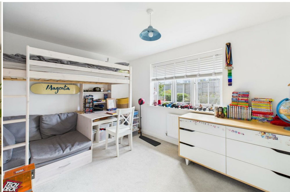
Baileys Meadow, Hayle, TR27 4FA