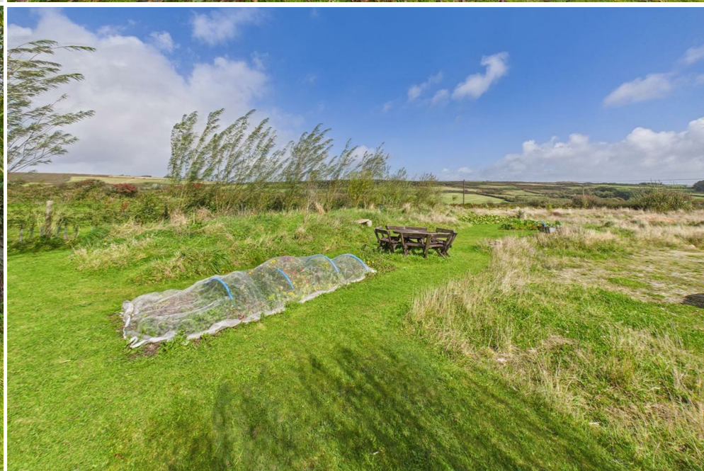
Bosulval, Penzance, TR20 8XA