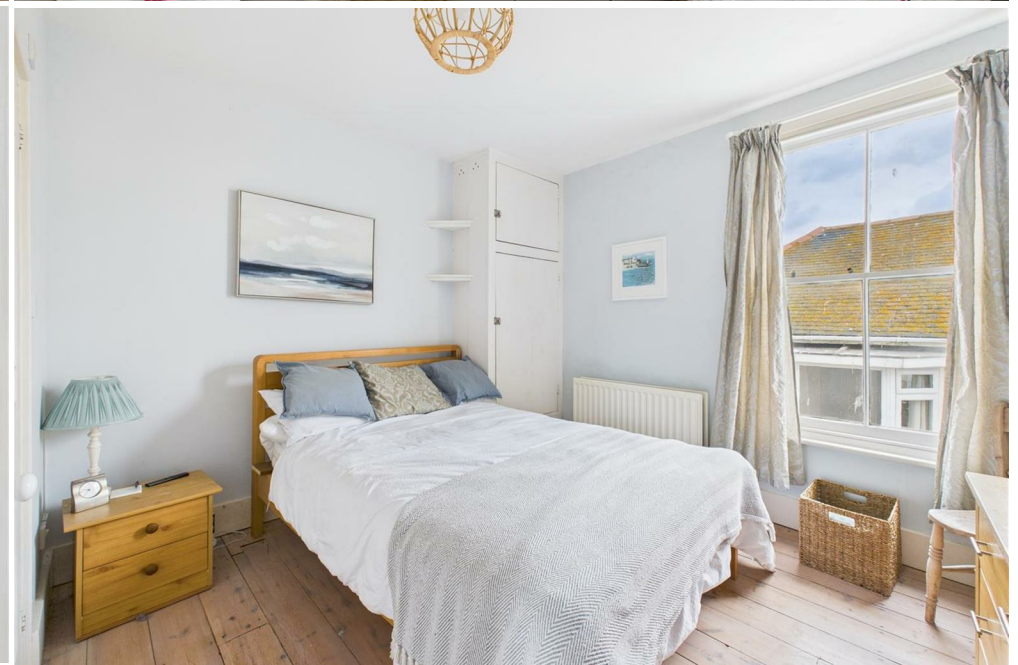
Quay Street, St. Ives, TR26 1PT