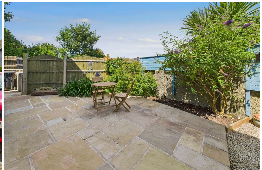
St. Johns Street, Hayle, TR27 4LN