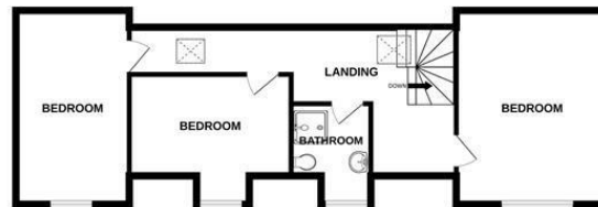
TOTAL FLOOR AREA: 1970 sq.ft. (183.0 sq.m.) approx.

Whilst every attempt has been made to ensure the accuracy of the floorplan contained here, measurements of doors, windows, rooms and any other items are approximate and no responsibility is taken for any error, omission or mis-statement. This plan is for illustrative purposes only and should be used as such by any prospective purchaser. The services, systems and appliances shown have not been tested and no guarantee as to their operability or efficiency can be given. Made with Metrepx ©2024