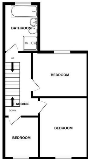
2ND FLOOR 196 sq.ft. (18.2 sq.m.) approx.