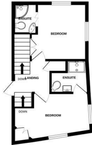
1ST FLOOR 289 sq.ft. (26.9 sq.m.) approx.