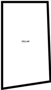
BASEMENT 293 sq.ft. (27.2 sq.m.) approx.