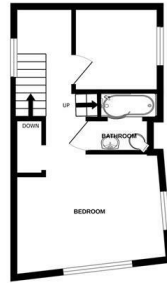
2ND FLOOR 282 sq.ft. (26.2 sq.m.) approx.