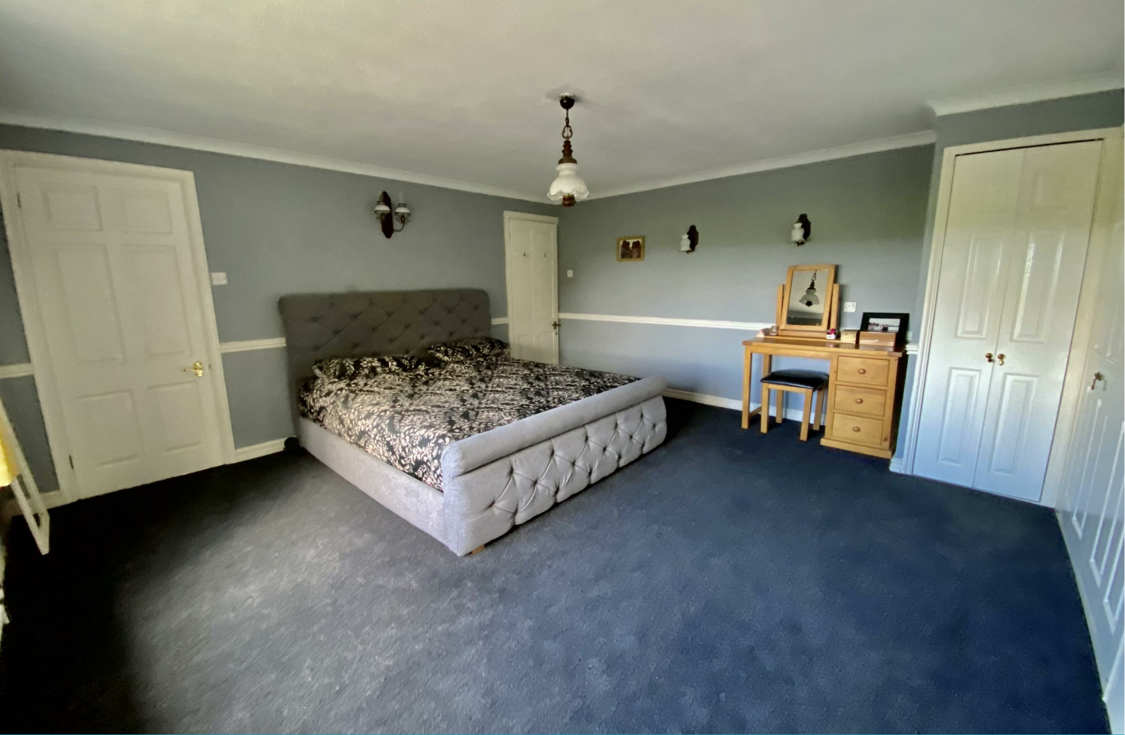
Conker Road, St. Erth Praze, Hayle, TR27 6EQ