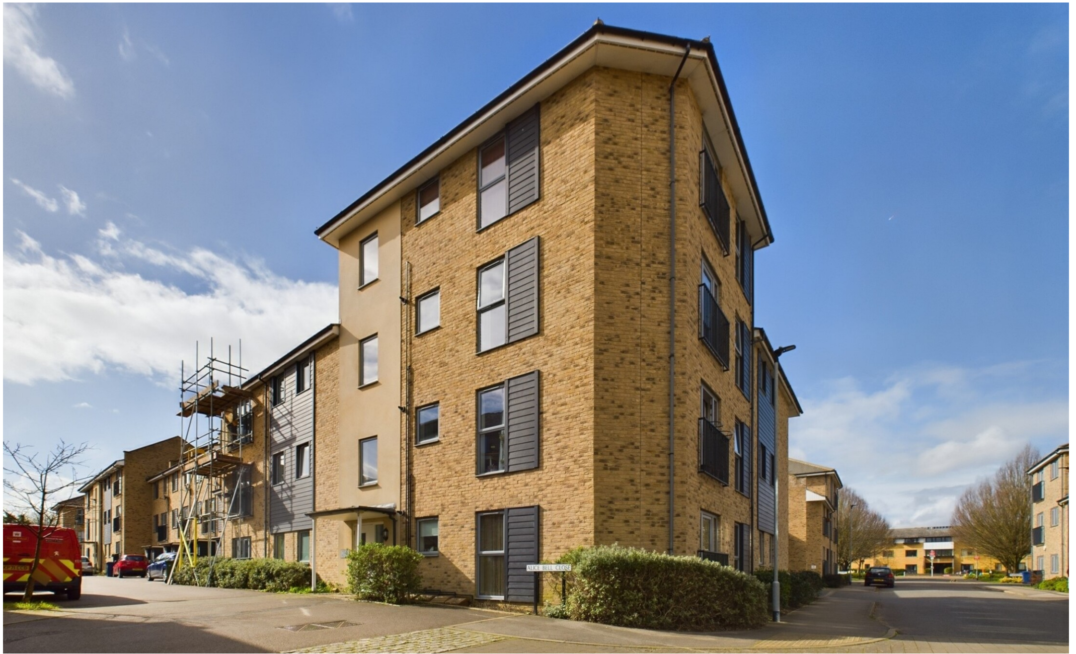
Alice Bell Close, Cambridge CB4 1YF