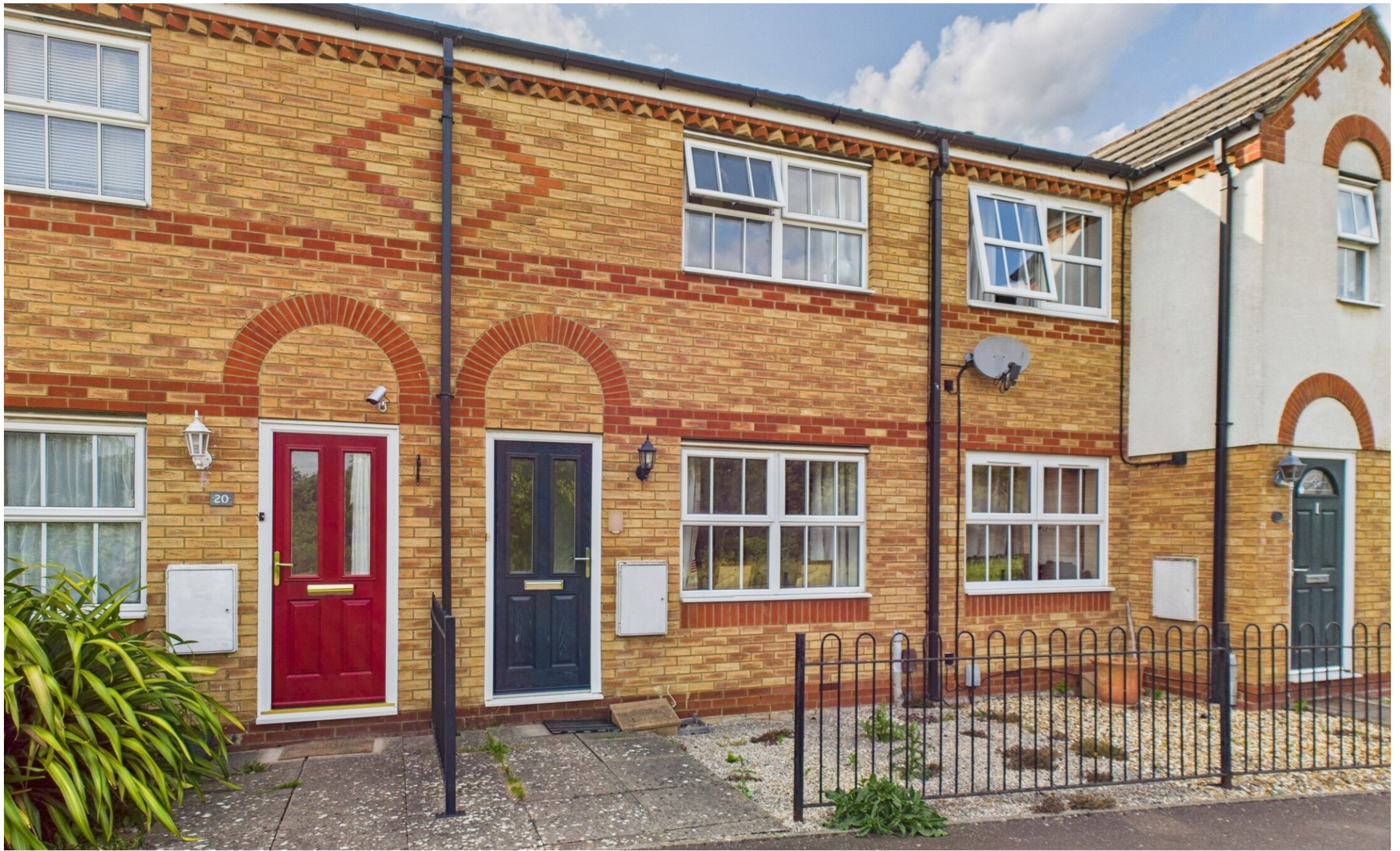
Tenison Manor, Cottenham CB24 8XL