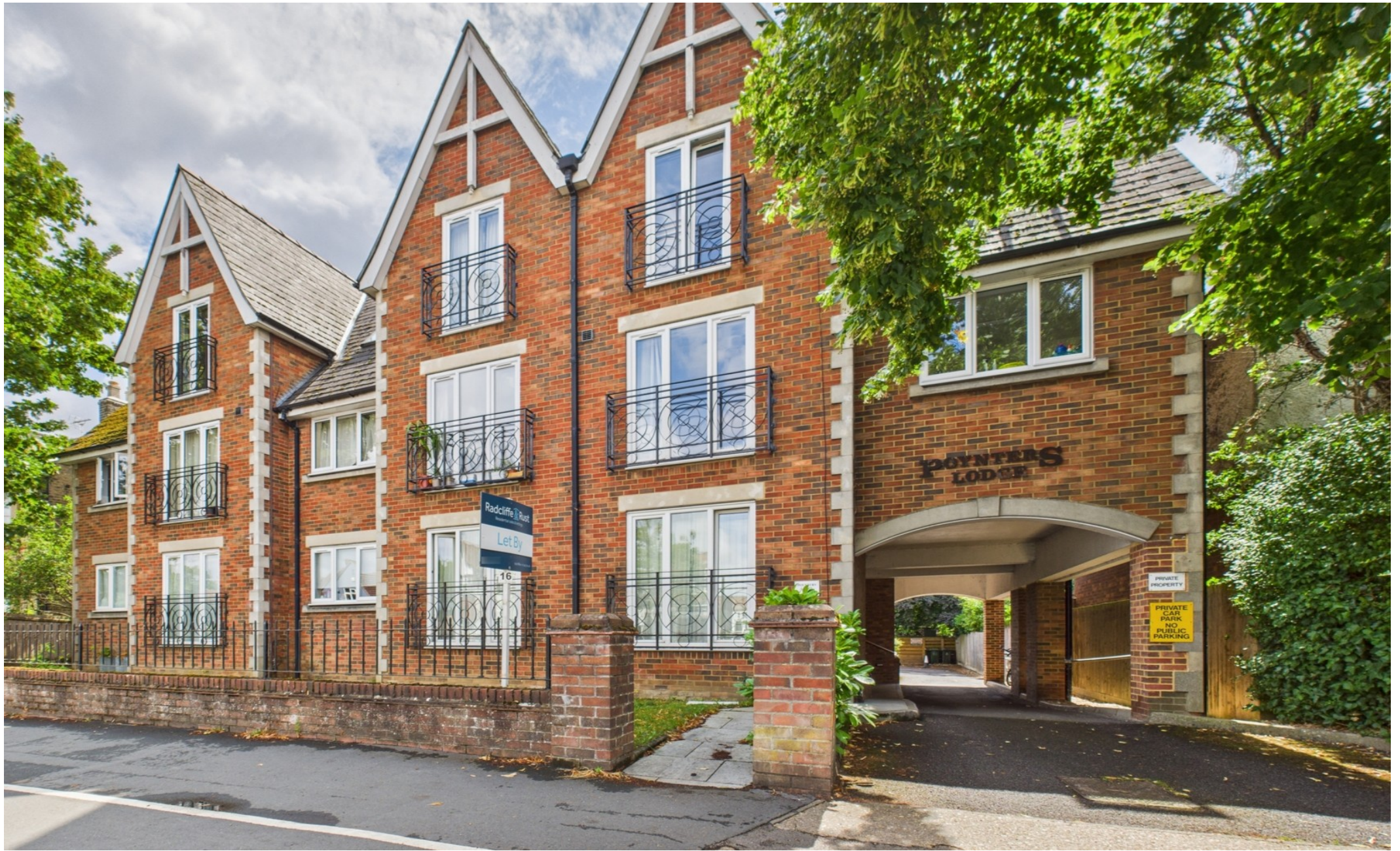
Poynters Lodge, Chesterton Road, Cambridge CB4 1JB