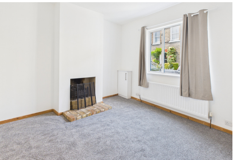
George Street, Cambridge, Cambridgeshire, CB4 1AL