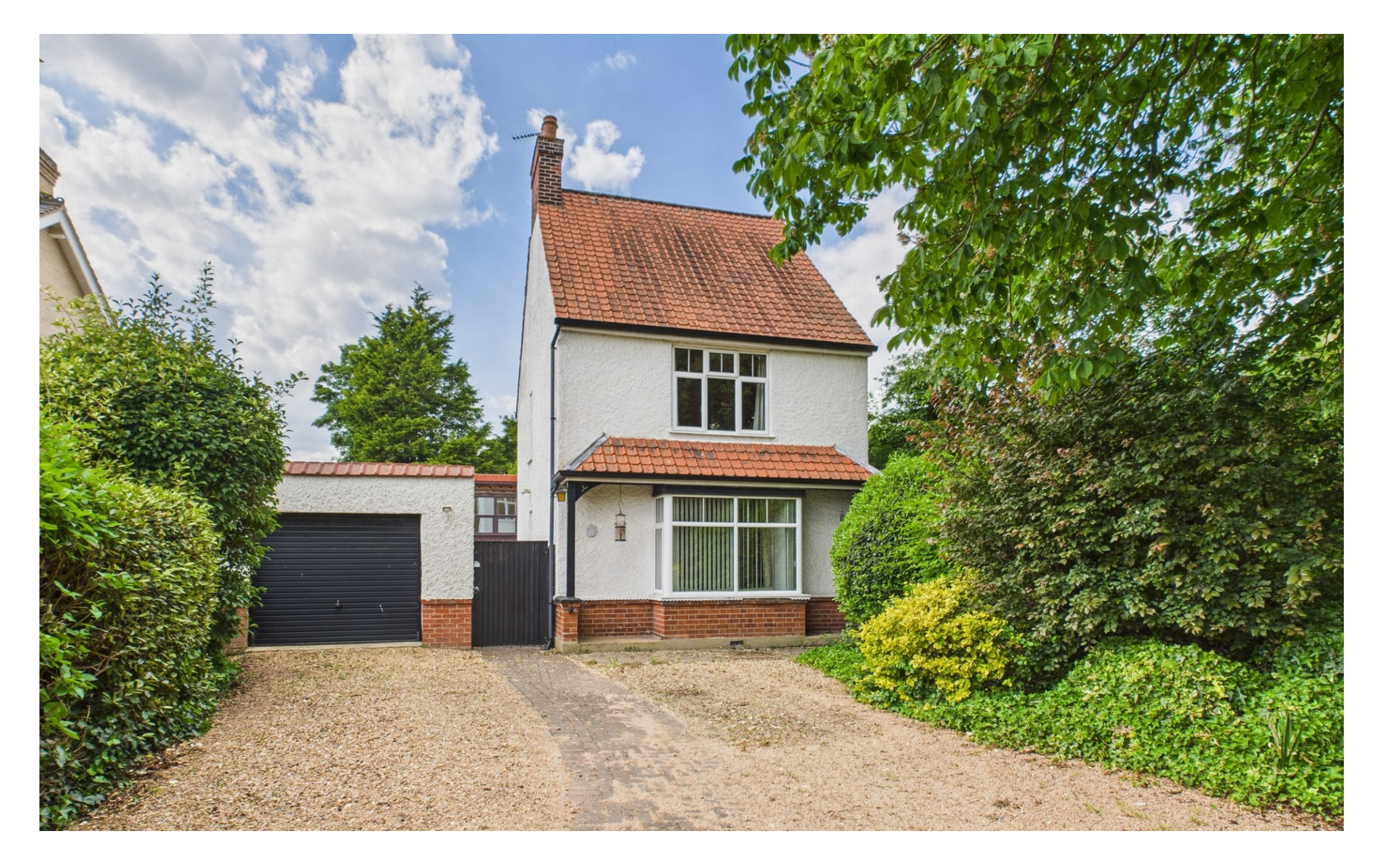
Hinton Way, Great Shelford, Cambridge CB22 5AH