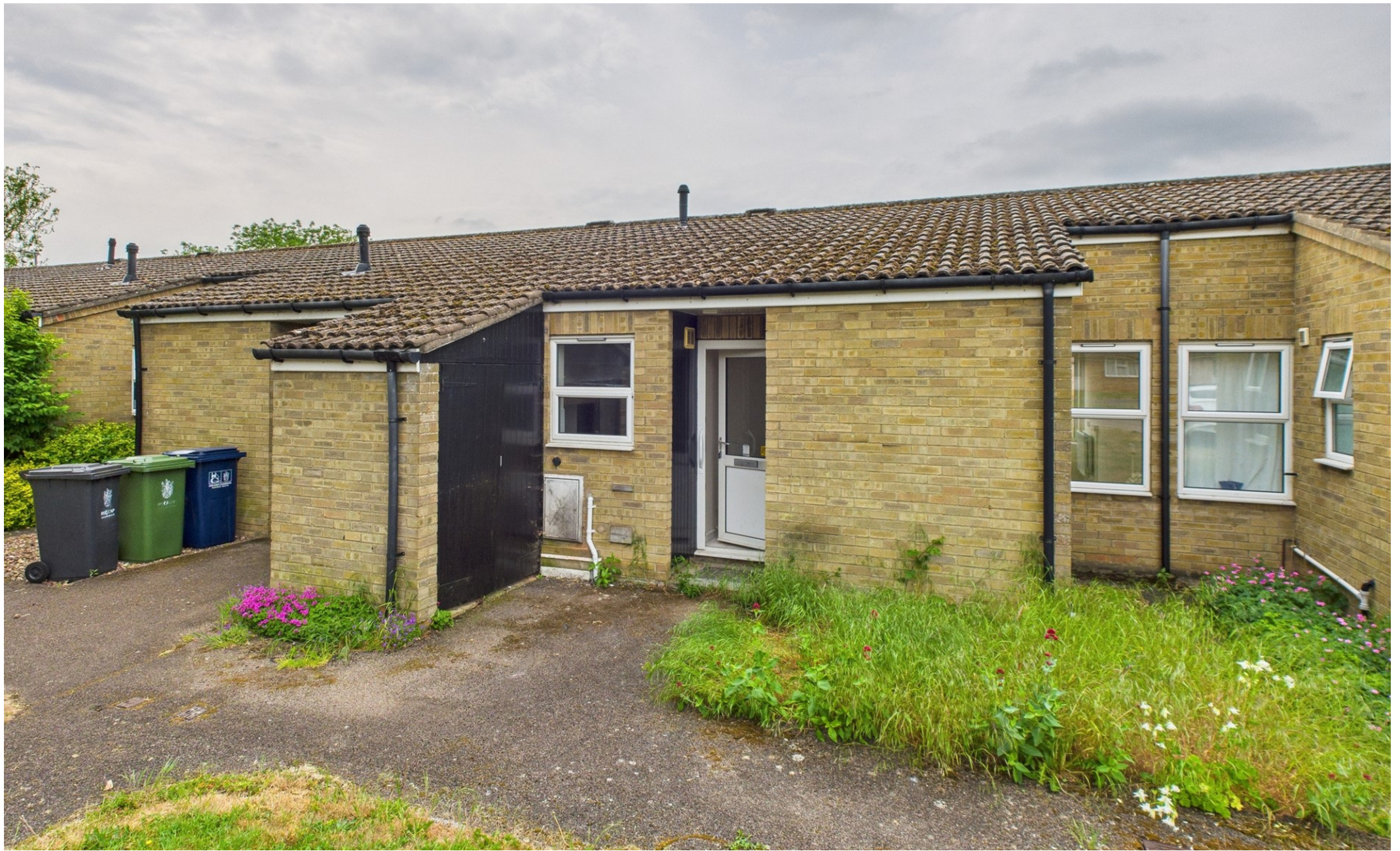
Queens Close, Harston, Cambridgeshire CB22 7QW