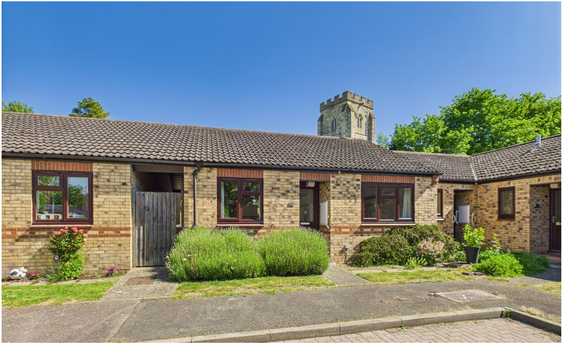
Lordship Close, Orwell, Royston SG8 5TH