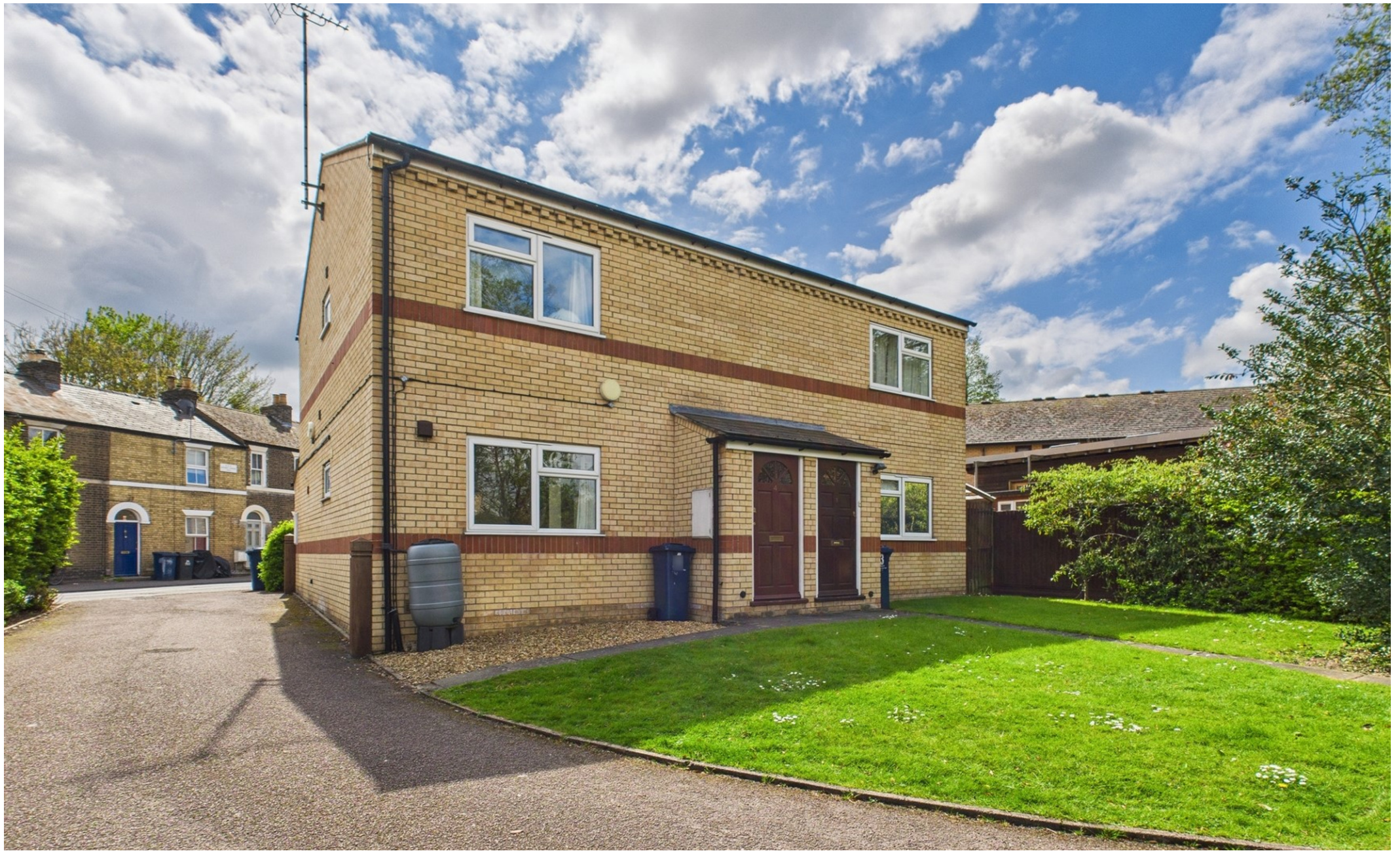
Prince William Court, Victoria Road, Cambridge CB4 3NL