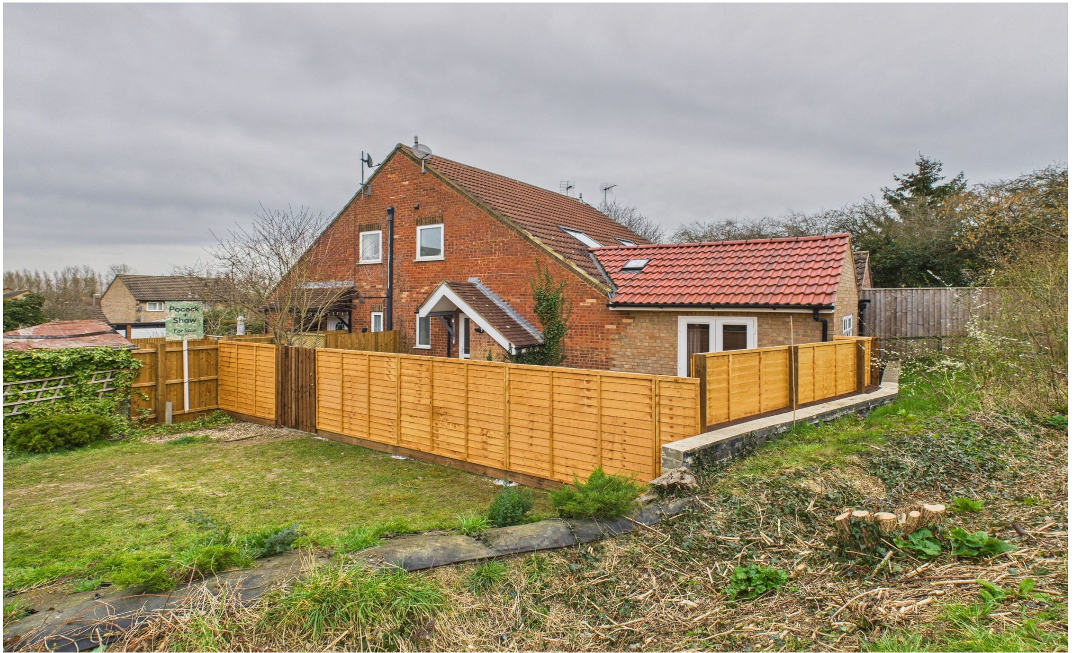
The Brambles, Bar Hill, Cambridge CB23 8SZ