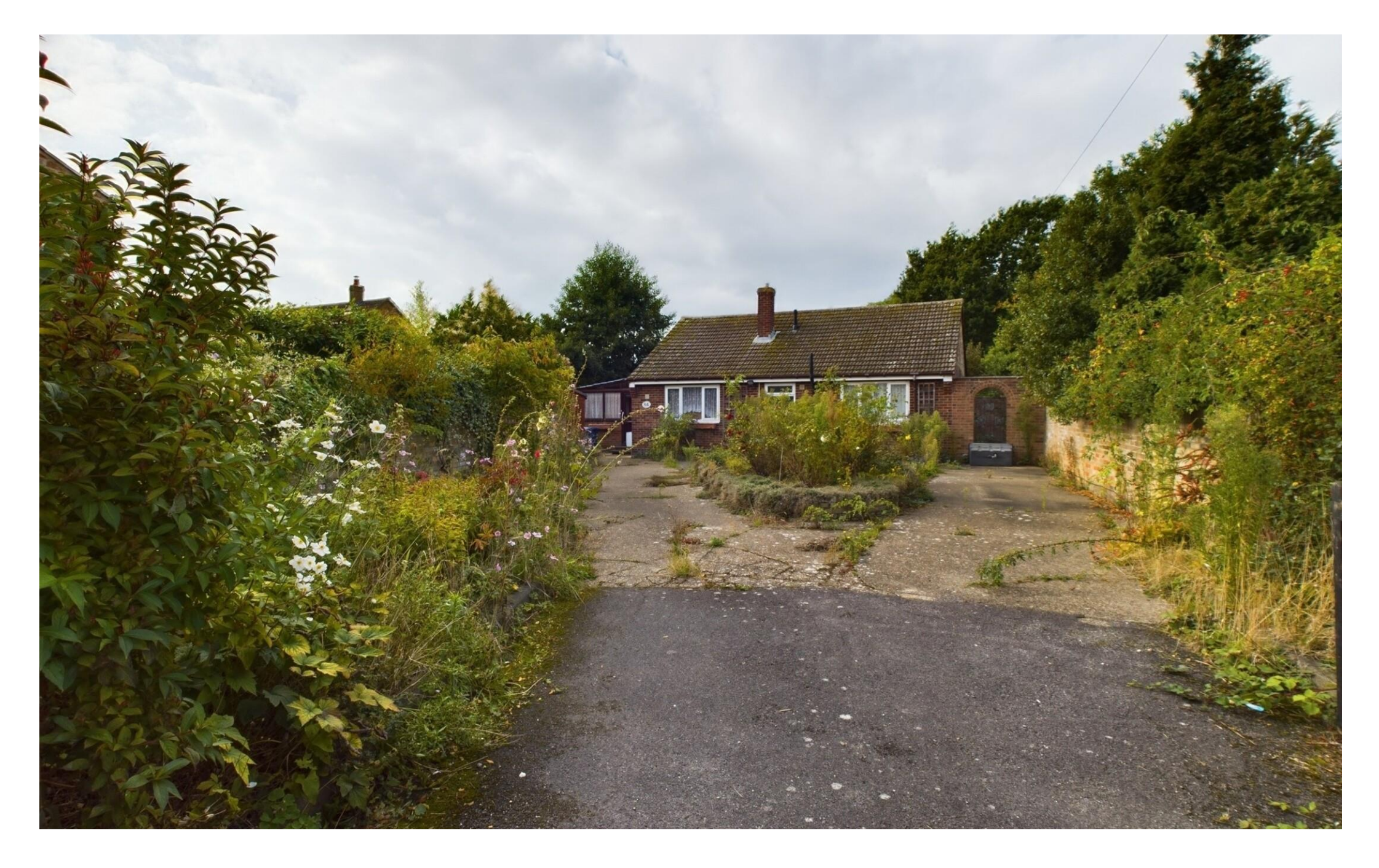
High Street, Cottenham CB24 8SD