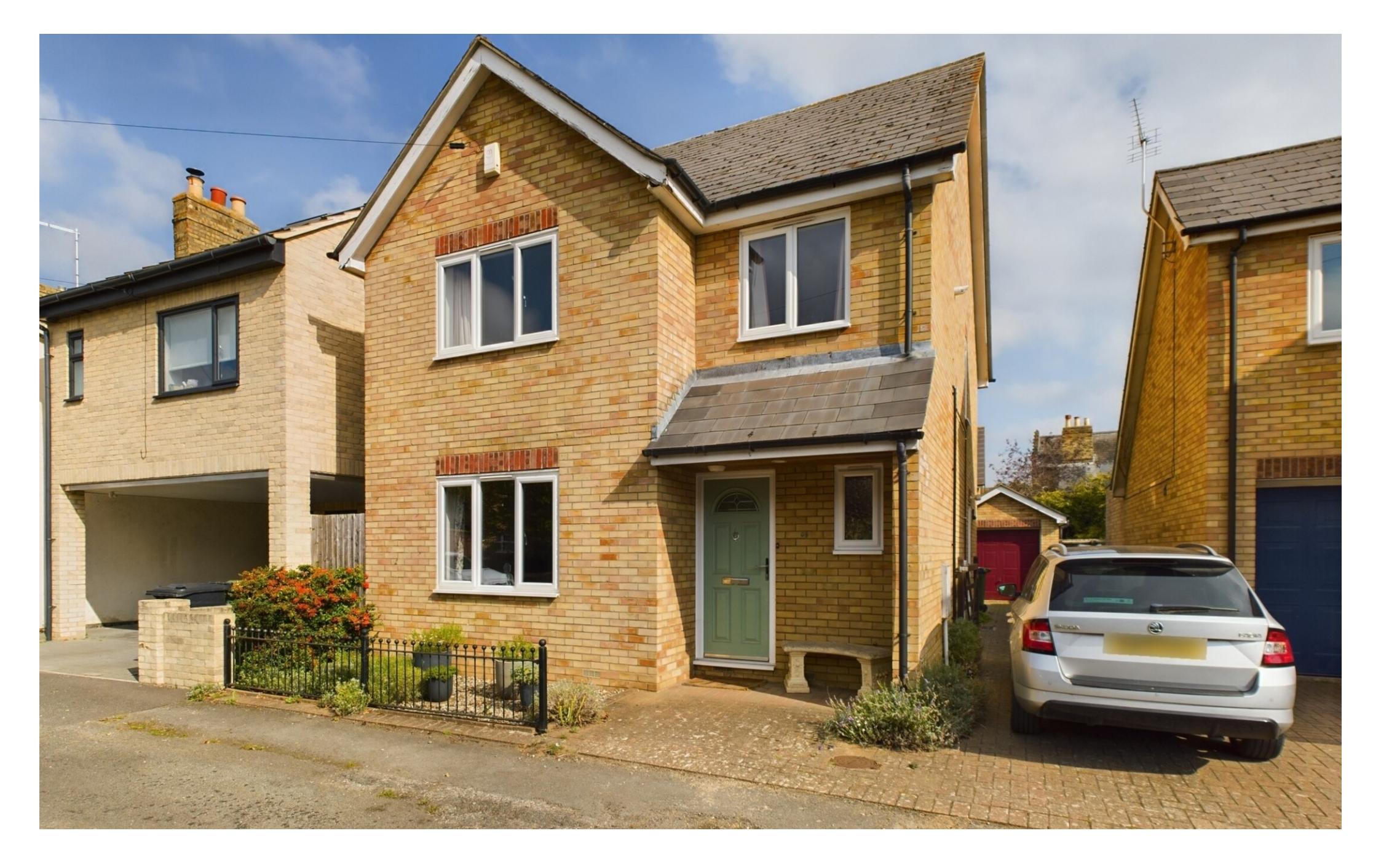
Margett Street Cottenham CB24 8QY