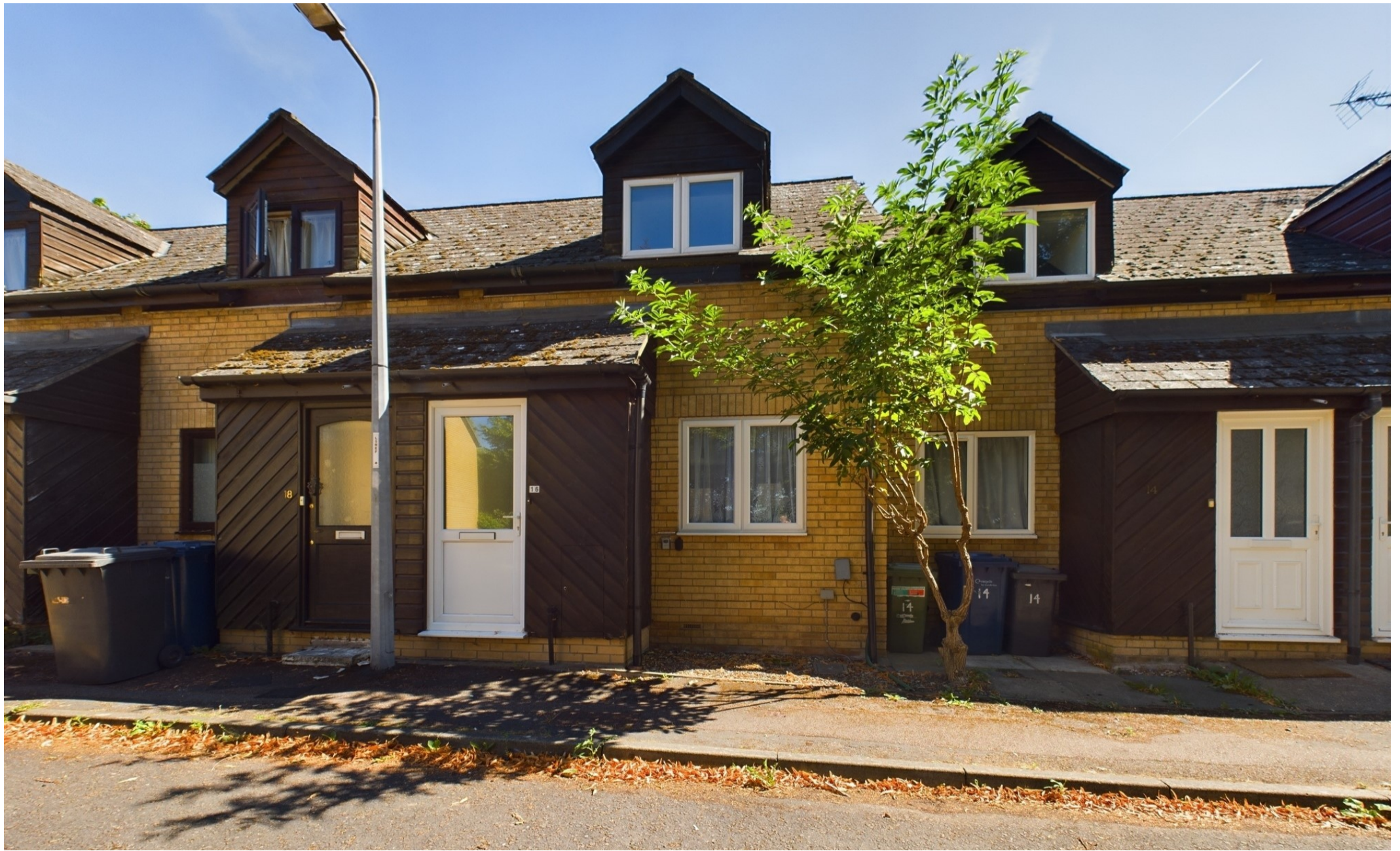
Primary Court, Cambridge CB4 1NB