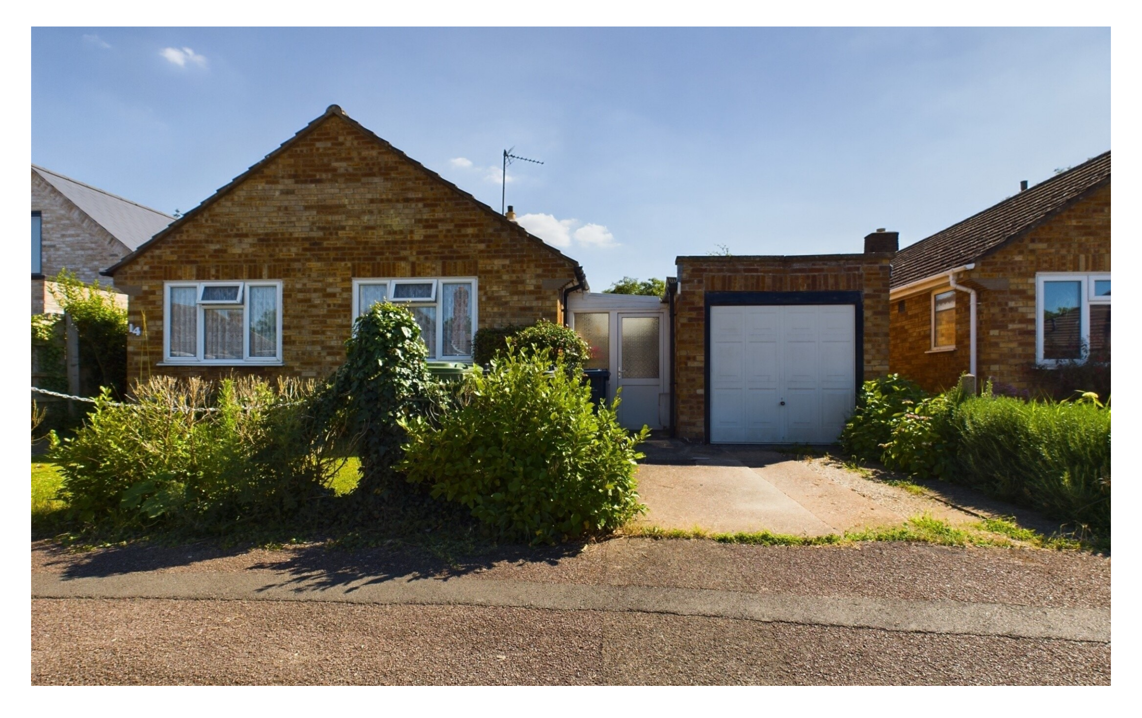
Thirleby Close, Cambridge CB4 3RS