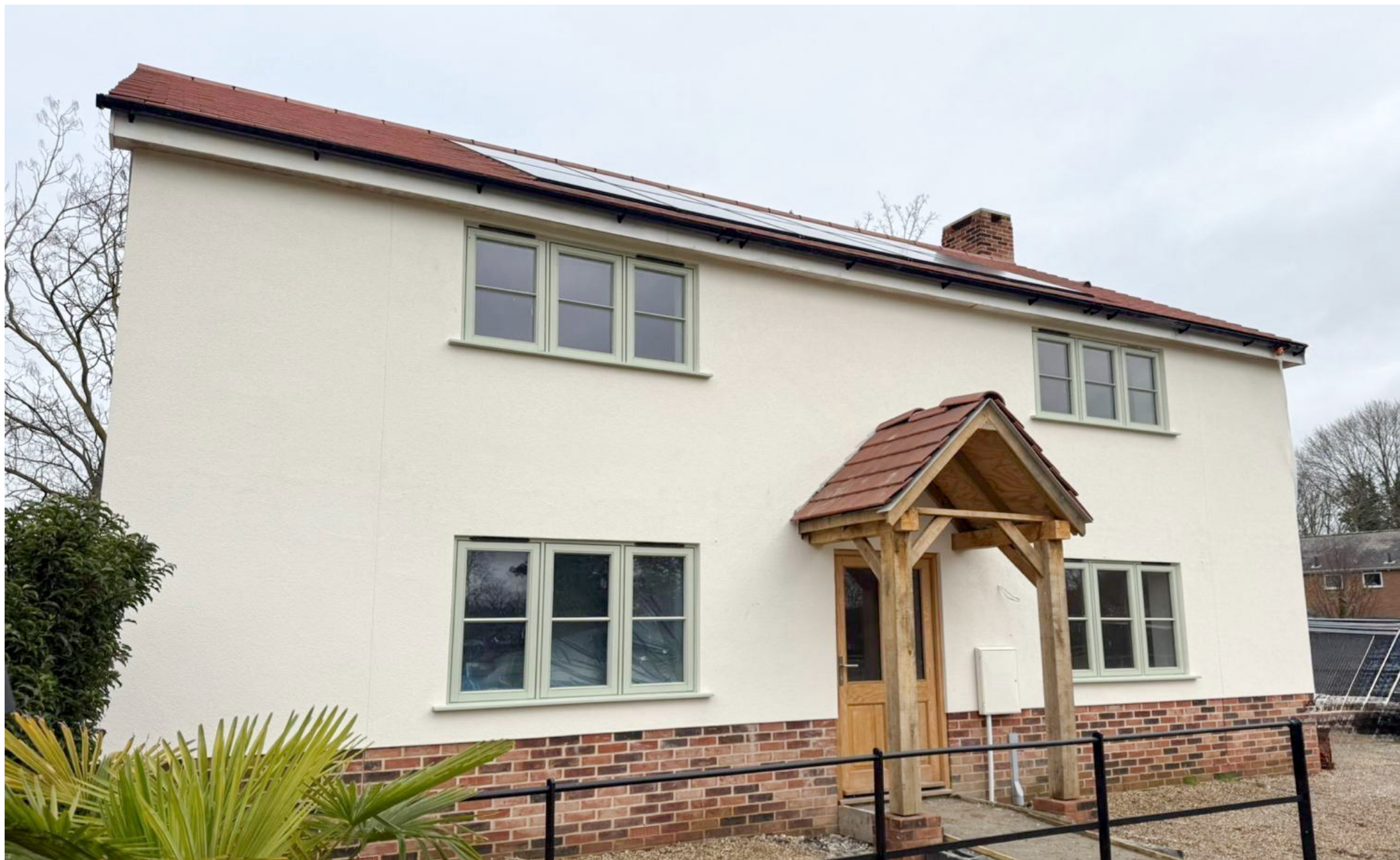
Plot 1 rear of 21 High Street, Harston CB22 7PX