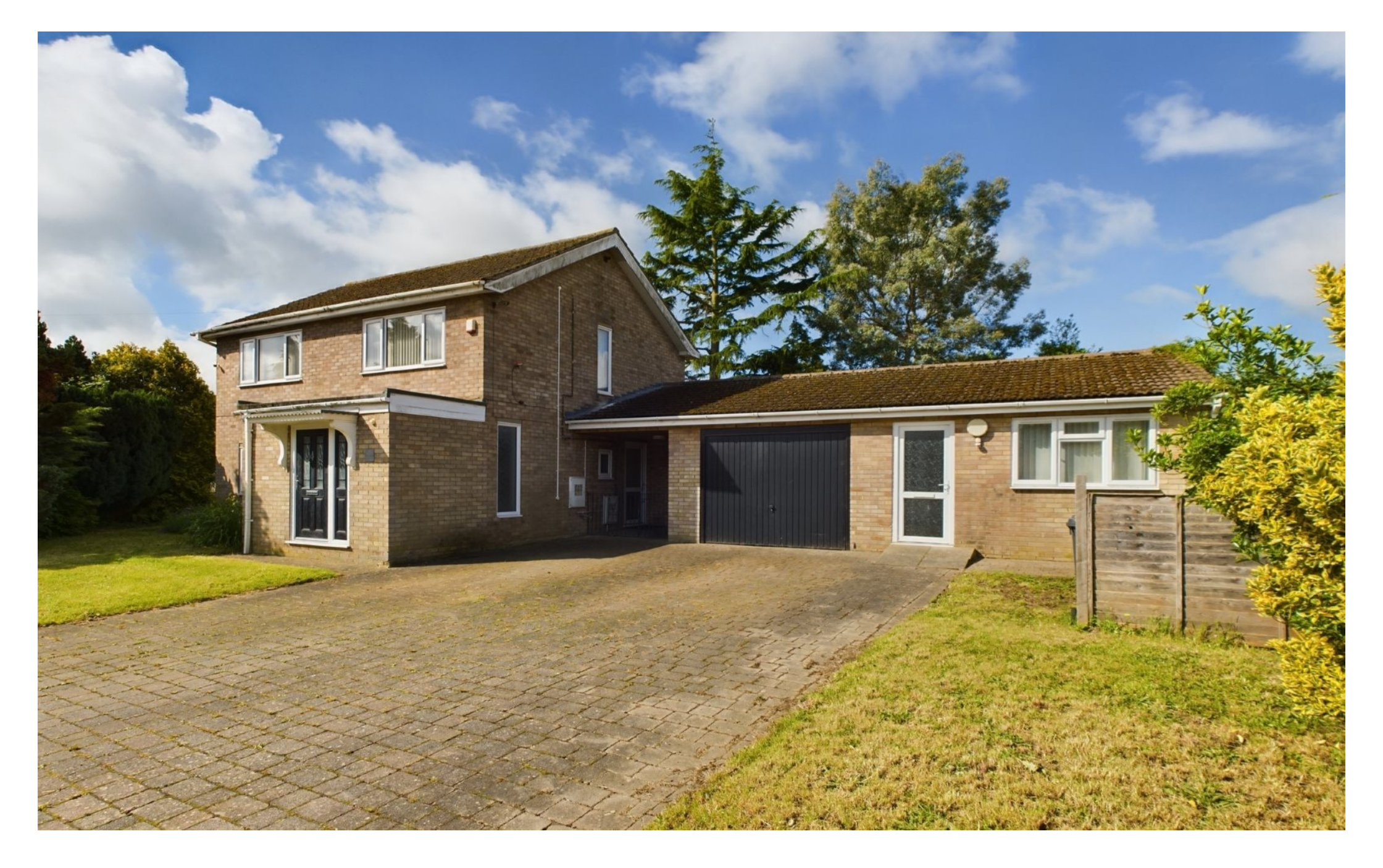
Telegraph Street, Cottenham CB24 8QU