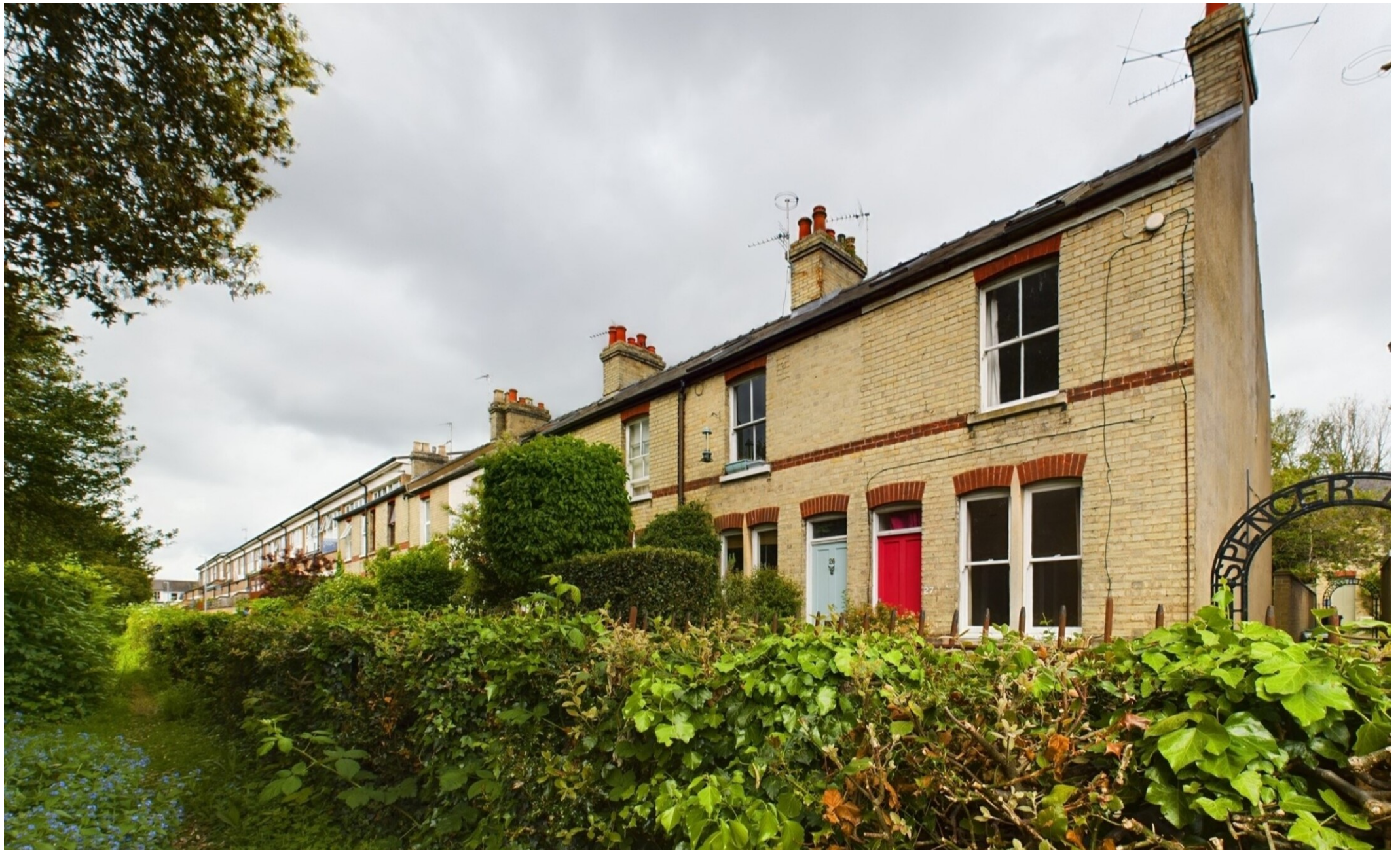
Bermuda Terrace, Cambridge CB4 3LD