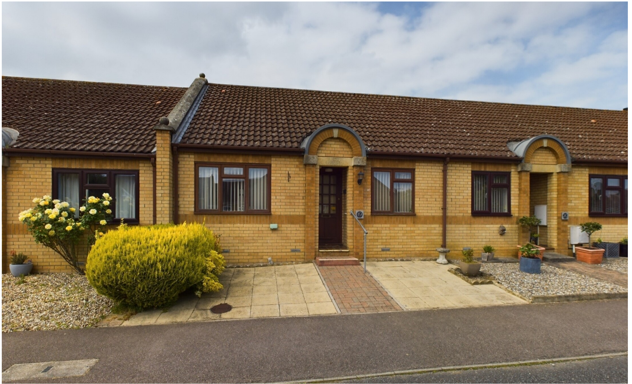
Moore's Court, Cottenham CB24 8XH