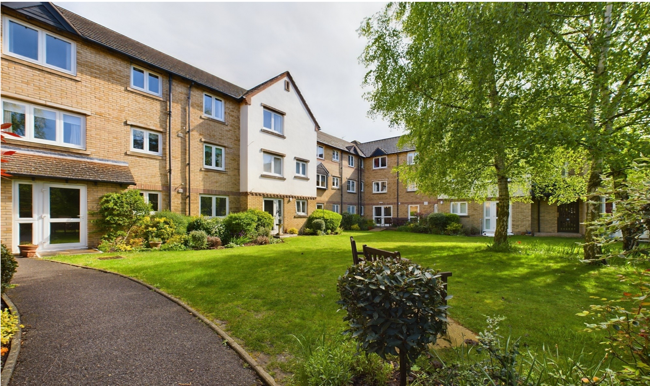
Haig Court, Cambridge CB4 1TT