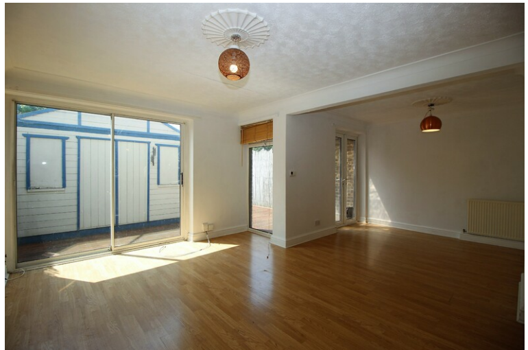
Huntley Close, Cambridge, CB5 8QX

£1,570 pcm Unfurnished 3 Bedrooms Available from 20/04/2024